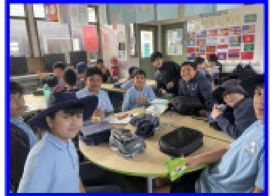
Hungry for their snack after time in the pool.

During the two week Swimming Program, the SSS students are split into six groups. Each group contains students from three different classes. This gives all of the senior students a chance to learn and socialise with a range of people. Mixing with new teachers and new friends helps with the transition process from primary school to high school.