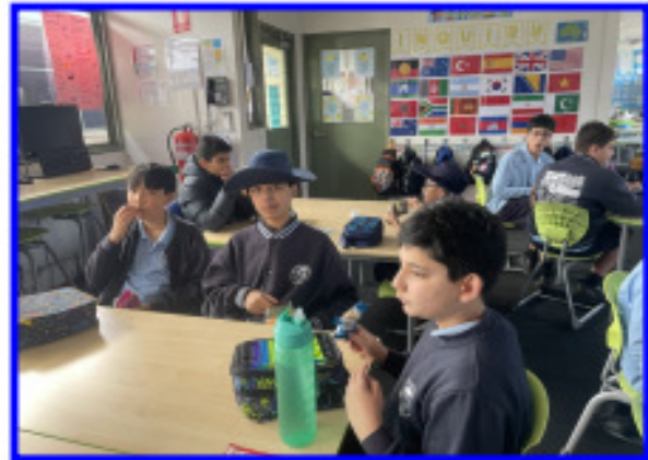
Socialising with friends from other grades.